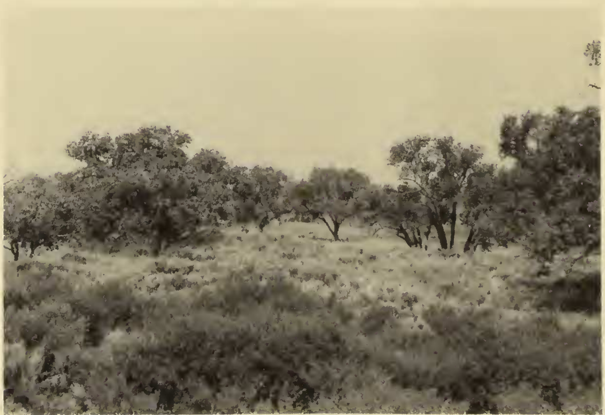
FIG. 2.—Riparian growth in Canadian River floodplain, Oldham County.